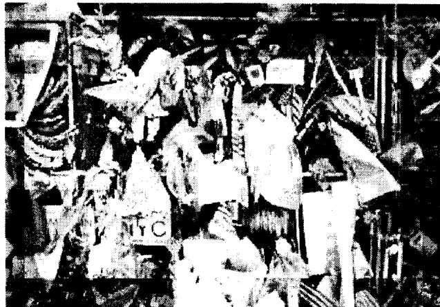
Remembrances left on the fence surrounding ground zero in NYC.

VOMA is committed to the use of restorative justice in response to crime. Some of the specific responses by the VOMA Board and members of VOMA are collected here. The VOMA Board asks its members to let VOMA know how they are responding to this tragedy, and in what ways VOMA can be helpful. Please contact us at voma@voma.org .